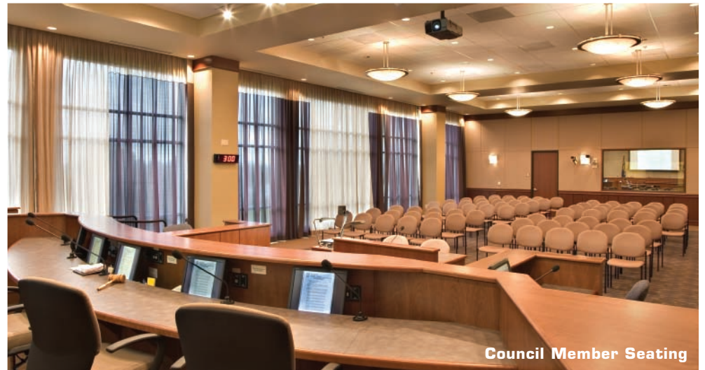
Council Member Seating